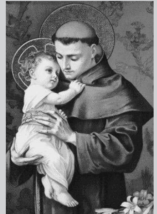
St. Anthony of Padua

Masses: Saturday 5:00 p.m. Sunday 8:30 a.m.